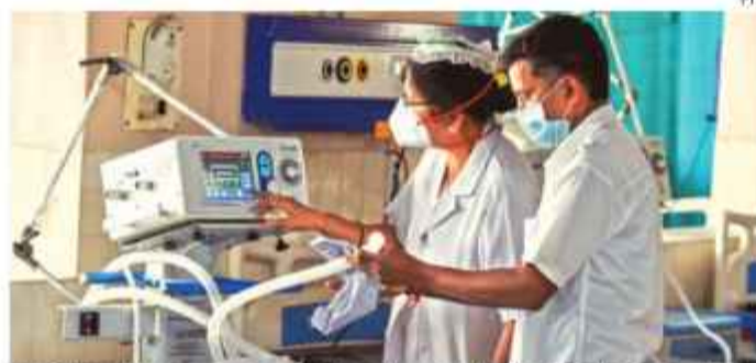
Health workers arrange medical equipment at a hospital in Hyderabad

LocalCircles, in a survey conducted between November 20 and December 18, received responses from over 24,000 citizens across 303 districts in India. The data revealed that 76 per cent of the respondents or their immediate family members did not undertake any Covid test despite experiencing symptoms like