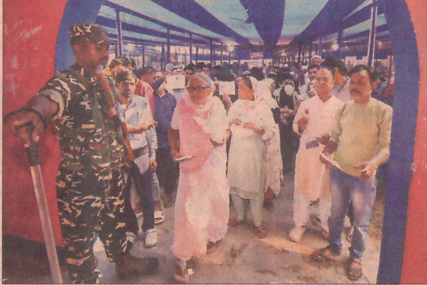
A security official keeps vigil as voters wait in queues to cast votes at a polling station during the first phase of the Bihar Assembly elections, in Patna, on Thursday

The remaining 122 seats of the 243-member assembly will vote on November 11, while the counting will take