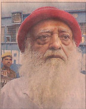
The Rajasthan High Court had on October 29 granted him six months' bail after his counsel argued he has been suffering from illness

The Rajasthan High Court had on October 29 granted him six months' bail after his counsel argued he has been suffering from prolonged ill-