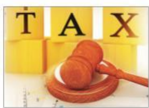
The fresh timelines for filing of appeals in tax cases are aimed at ensuring a zero delay regime in matters being heard in SC

been introduced for submitting the proposal to file the SLP enlisting certain additional details including appeals involved against the SLP filed, specific issue wise tax effect involved in SLP proposal apart from the aggregate tax effect on disputed issues, reasons recorded and approval of PCIT in case of reassessment etc.