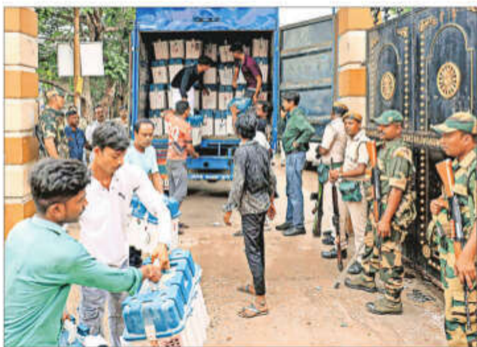
Polling officials carry sealed EVMs, to be kept in strong rooms before declaration of results of the West Bengal Assembly elections, in Howrah on Thursday (left); West Bengal CM Mamata Banerjee shares a video message ahead of counting on May 4

Asking TMC workers to remain calm, she said they must not "retaliate right now" if attacked. "I am asking our workers and the general people to guard the strong rooms and counting centres. I ask all our candidates in 294 seats to individually guard the strong