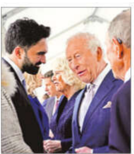
Britain's King Charles with New York City Mayor Zohran Mamdani during a visit to the 9/11 Memorial

joint meeting of the US Congress Tuesday, as he and Queen Camilla were honoured at a state dinner hosted by President Donald Trump and First Lady Melania Trump in the White House.