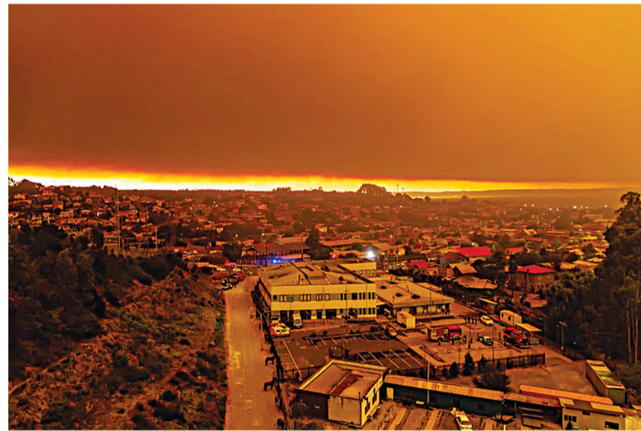
Wildfires burn at sunrise near Lirquen, Chile.