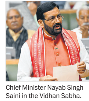
Chief Minister Nayab Singh Saini in the Vidhan Sabha.

He said saints, spiritual leaders and khap representatives had also been associated with the campaign to spread awareness about the harmful consequences of drug abuse through their