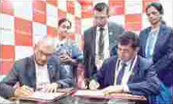
விமான சரிபொருள் எதிர்பார்த்த சேய்ப்பிழிந்ததொக ஆகாசா ண் - இந்தியன் ஆயில் நிறுவனம் ஒப்பந்தம்.

விமான சரிபொருள் எதிர்பார்த்த சேய்ப்பிழிந்ததொக ஆகாசா ண் - இந்தியன் ஆயில் நிறுவனம் ஒப்பந்தம். விமான சரிபொருள் எதிர்பார்த்த சேய்ப்பிழிந்ததொக ஆகாசா ண் - இந்தியன் ஆயில் நிறுவனம் ஒப்பந்தம்.