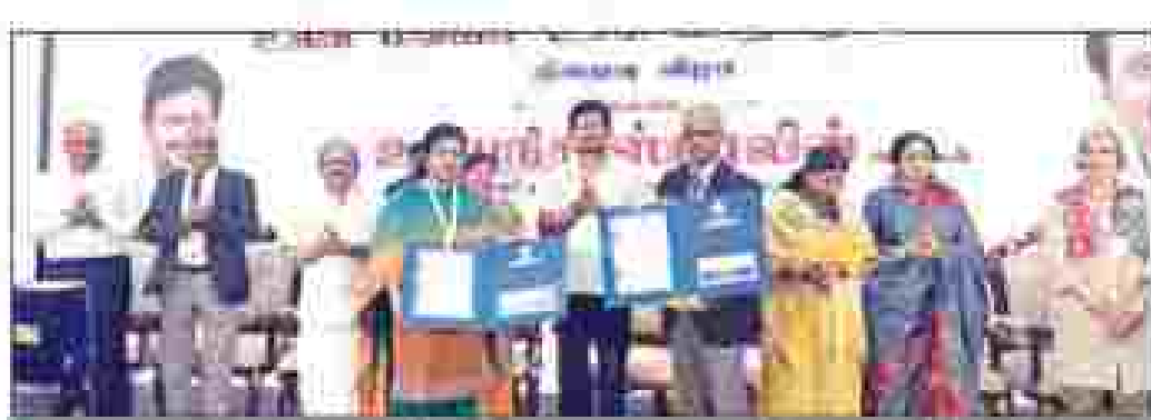
உரைக வாழ்வாதார இயக்கத்துடன் பேங்க் ஆஃப் பரோபா புரிந்துணர்வு ஒப்பந்தம் செய்துகொண்டது.