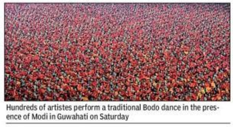
Hundreds of artistes perform a traditional Bodo dance in the presence of Modi in Guwahati on Saturday

blaming "TMC's syndicates" for the mess, Modi blamed "TMC's goons" for attacks on media personnel in Beldanga. "They have behaved indecently with a woman journalist. No one takes cognizance of women's plight in Bengal." The PM moved on to BJP's pre-poll concerns, trying to assure Matuas and Namasudras the Constitution had given them the right to stay here. "CAA has given them full security," he said. BJP has faced internal dissent in the Matua belts of North 24 Parganas and Nadia, with party MPs and MLAs often speaking in different voices and the community hitting the streets to protest against their "victimisation" in SIR. TMC seniors, including CM Mamata Banerjee, have visited these areas to address concerns. A person from the community died this week, prompting his family to blame "SIR worries".