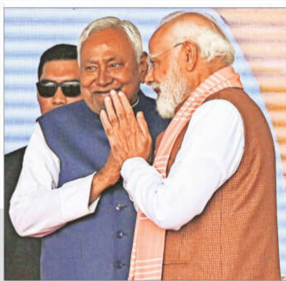
Bihar CM Nitish Kumar greets Prime Minister Narendra Modi being after the swearing-in ceremony in Patna on Thursday

a proven track record of good governance for many years. My best wishes to him for his tenure ahead," Modi wrote on X.