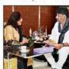
Shaw meets Shivakumar after the meeting, Shivakumar said Shaw had assumed cooperation of the industry for Bengaluru's development.

Bengaluru: Biocon chief Kiran Mazumdar Shaw Tuesday met Karnataka CM Siddaramaiah and his deputy D K Shivakumar to greet them on the occasion of Deepavali, and assured cooperation and support for Bengaluru's development. Shaw has been critical of Bengaluru's infrastructure woes by highlighting them through her social media posts, and has been repeatedly urging the state govt to intervene. Shivakumar also the minister in charge of Bengaluru Development, later told reporters that Shaw has assumed cooperation and support of the industry for Bengaluru's development. "Bloom chief Kiran Mazumdar Shaw" visited Cauvery (CM) official residence and met chief minister Siddaramaiah on the occasion of Deepavali, the CM's office said in a statement. Shaw met Shivakumar at his Siddavilvarajpet residence in Bengaluru. Asked whether there was any discussion regarding Bengaluru with Shivakumar, said, "Of course, they (industry leaders) have agreed that they are going to cooperate with the development of Bengaluru and they will not hurt Bengaluru. They will support Biocon."