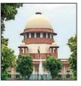
SC seeks Centre's help on online gambling ban plea

A bench of justices JB Pardiwala and JY Vaidyanathan asked the counsel appearing for the petitioner to serve a copy of the PIL to the counsel for the central government. 'We request VC Bharti to look into the petition and assist us on the next date of hearing. List after two weeks in a regular manner on a date to be notified on Friday.'