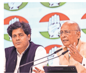
Congress MPs Abhishek Manu Singhvi and Imran Pratapgarhi at AICC office, in New Delhi, Thursday.

Congress RS member and minority department chairperson Imran Pratapgarhi said, "We thank the Supreme Court for the interim relief. The points we had raised in petitions and in Parliament were considered by the Supreme Court and the relief today shows that this law is against the Constitution."