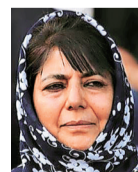
PDP chief Mehbooba Mufti

FORMER JAMMU & Kashmir chief minister and Peoples Democratic Party (PDP) chief Mehbooba Mufti Thursday said the Supreme Court should keep "collective conscience" and "sentiments" in mind when deciding the petitions against the Waqf law, just "like they did in the cases of Babri Masjid and Afzal Guru".