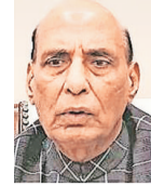
Defence Minister Rajnath Singh

growing defence capability is not meant to provoke conflict. "Our defence capabilities are like a credible deterrence, to maintain peace and tranquillity. Peace is possible only when we remain strong," he added.