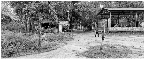
POST NEWS NETWORK

Over 9,000 families in Danagadi, Sukinda, Korei, and Barchana blocks have received land pattas under FRA, but only 1,766 have been provided with housing