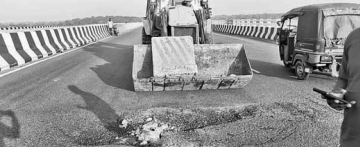
POST NEWS NETWORK

Parjang, Nov 9: Just a month after the opening of the new 900-metre Brahmani river bridge, part of the National Highway connecting Parjang in Dhenkanal district and Talcher in Angul district, significant structural issues are causing alarm among the locals.