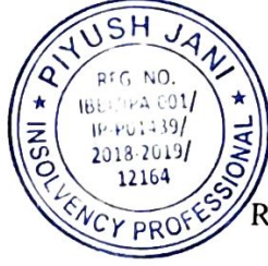
Piyush Kisanlal Jani

Submission of false or misleading proofs of claim shall attract penalties.