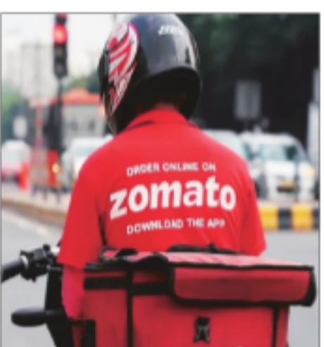
post acquiring online restaurant discovery guide Obedovat.sk. "Zomato Slovakia, (a) step down subsidiary

Zomato had entered into the Slovakian market in 2014