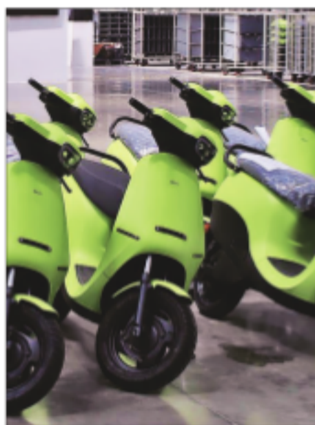
launch in Bengaluru some time next week. Users in select areas of Bengaluru, however, were able to use the bike taxi service on Saturday.

An Ola spokesperson told Financial Express that the service is scheduled for an official