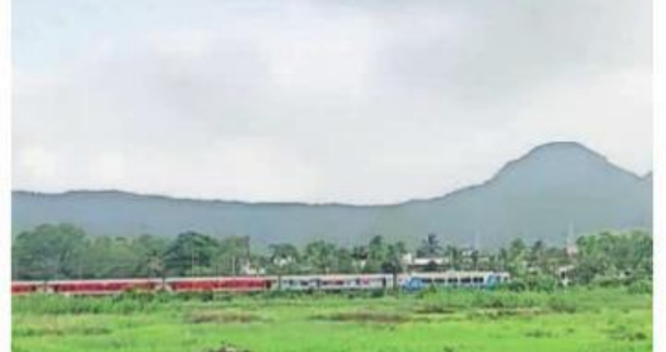
A close watch is being kept to prevent major accidents in areas that are particularly susceptible to landslides, hill slips, and boulder falls, say officials. Express file

AMIDST THE ongoing rainfall in the state and reports of landslides in hilly areas, the Central Railway (CR) is on alert to deal with incidences of landslides and is taking pre-emptive measures to avoid boulder falls in the treacherous Bhor Ghat on Pune-Mumbai section, which often disrupt train traffic. Railway officials said several preventive measures were undertaken before the start of monsoon and a close watch is being kept to prevent a major incident in areas that are particularly susceptible to landslides, hill slips and boulder falls. In 2019, the damage caused to the train tracks, tunnels and other railway infrastructure due to landslides was so heavy that it had affected train operations between the two cities for 14 days. Over the last week, two major landslides occurred on Pune-Mumbai Expressway near Adoshi in Raigad. Although these incidents did not affect train traffic, continuous rainfall has mobilised authorities to keep a close watch in the area. As per officials, works like the desilting of drains, cleaning of cul-