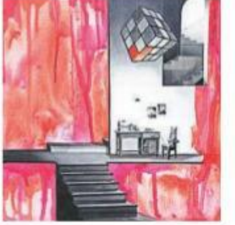
In his concept note, the artist had said that 'Life Corner' was a project that evolved over the years.