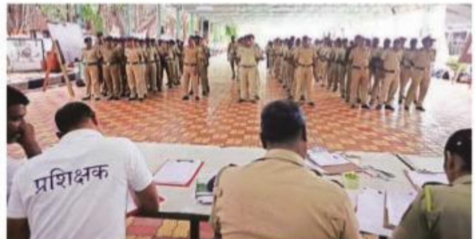
Pune city police personnel in Shivajinagar on Sunday ahead of PM Narendra Modi's visit.