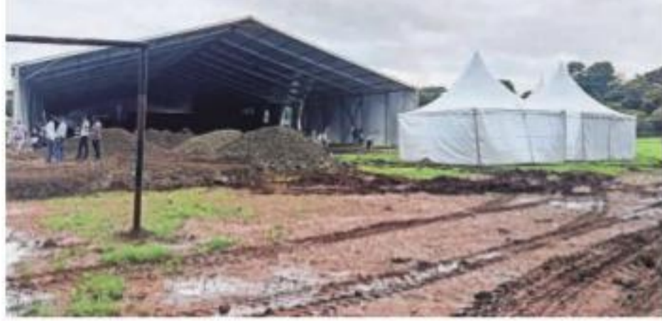
Preparation underway at the SP College ground where PM Narendra Modi will be felicitated on August 1.

The inauguration of the two metro stretches is an important step towards realising the PM's vision to provide citizens with modern and environment-friendly mass rapid urban transport systems across the country, officials said. The design of some metro stations on the route draw inspiration from Chhatrapati Shivaji Maharaj. The metro stations — Chhatrapati Sambhaji Udyan and Deccan Gymkhana — are designed to resemble headgear worn by soldiers of Chhatrapati Shivaji Maharaj — also known as 'mavala pagadi'. The Shivaji Nagar underground metro station has a distinctive design which reminds one of forts built by Chhatrapati Shivaji