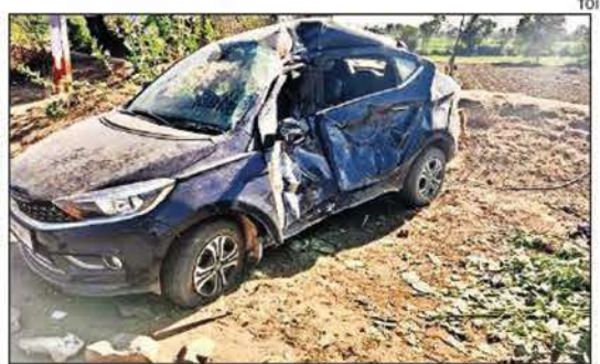
The collision took place between a motorcycle and a car near Vagrol village of Dantiwada taluka