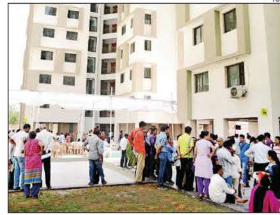
A formal announcement in this regard is likely to be made soon

Sources indicated that apart from postponing jantri rate revision to April, the government is also likely to provide concessions in jantri for affordable housing schemes. Sources added that the government is also considering the option of relaxation in FSI calculations, which was one of the major demands of builders. It is also likely to consider relaxation in calculation of NA premium.