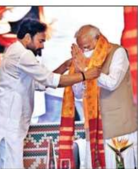
PM Modi at the BJP national executive meeting in Hyderabad

Hailing the Modi government's governance model, Pradhan described the government as a "reformist and decisive government", which inherited a policy paralysis government. Pradhan said the welfare of the poor is the main