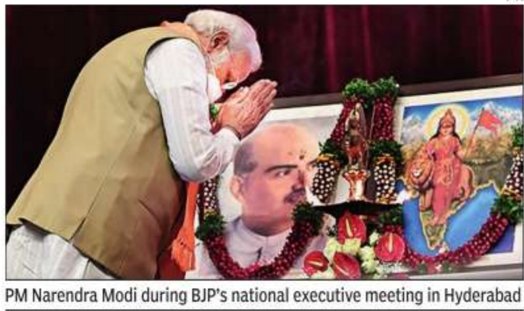
PM Narendra Modi during BJP's national executive meeting in Hyderabad

These parties are trying to ensure that government programmes are met with