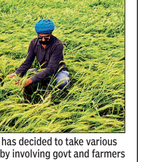
The group has decided to take various measures by involving govt and farmers

It has been stated that one of the prominent reasons for depleting water is cultivation of rice which Punjab produces for the nation. Although rice is not a native crop of Punjab, its cultivation has been encouraged by the central government to ensure food security of the nation.