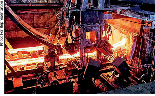
Mandi Gobindgarh houses more than 600 factories

Chandigarh: The Punjab Pollution Control Board (PPCB) has blamed the National Highway Authority of India (NHAI), municipal council, and state's public works department for the road dust and vehicular emissions that have worsened the air quality of industrial town Mandi Gobindgarh.