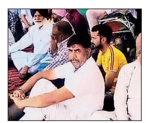
Locals during a protest outside Bhucho police post