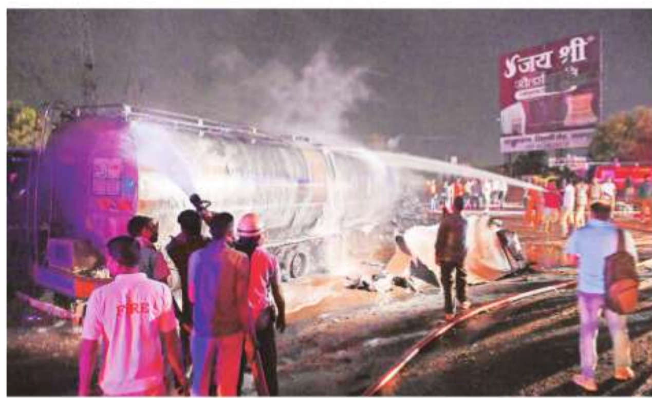
Firefighters douse flames after the accident on Tuesday night. Rohit Jain Paras

Mokhampura police station SI Jayprakash told The Indian Express, "Around 10:30 pm on Tuesday, a tanker truck carrying chemicals collided with another truck laden with LPG cylinders. The LPG truck was parked on the road side while its driver was having food at a nearby dhaba. The tanker driver died after the driver's cabin caught fire due to the impact of the accident."