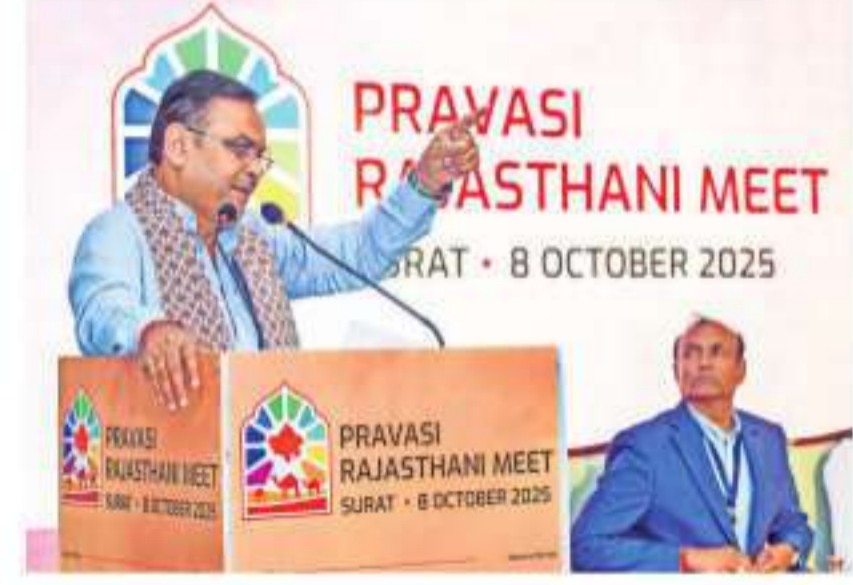
Chief Minister Bhajan Lal Sharma speaks during the 'Pravasi Rajasthani Meet', in Surat Wednesday.

RAJASTHAN Chief Minister Bhajan Lal Sharma on Wednesday said the state was poised to become a $350 billion economy by 2030, and has a very investment-friendly environment.