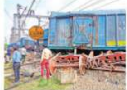
At the accident site on Wednesday.

THIRTY-EIGHT wagons of a food grains-laden goods train derailed near New Sri Madhopur station on the Western Dedicated Freight Corridor at 11:05 pm on Tuesday, causing major disruptions to operations along the entire corridor, sources said.