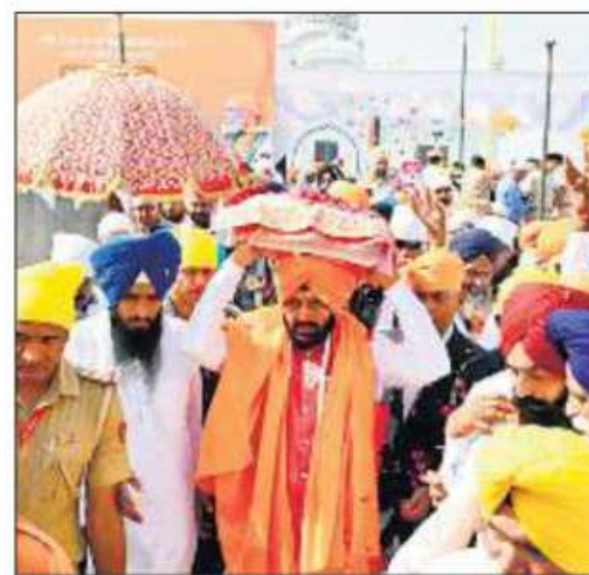
Chief Minister Nayab Singh Saini carries Guru Granth Sahib during a nagar kirtan held at Rori in Sirsa on Saturday.

Chief Minister Saini said that four sacred processions would be taken out across Haryana to mark the 350th martyrdom year of the Guru. On November 25, a grand gathering will be held at Kurukshetra with Prime Minister Narendra Modi attending as chief guest.