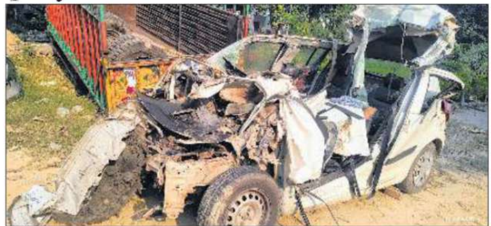
The mangled remains of the car that met with an accident in Shamli district of Uttar Pradesh.

The police suspect that the car was moving at a very high speed due to which the driver failed to control the