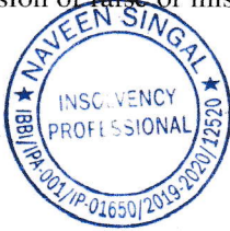
Naveen Singal (Interim Resolution Professional)

Submission of false or misleading proofs of claim shall attract penalties.