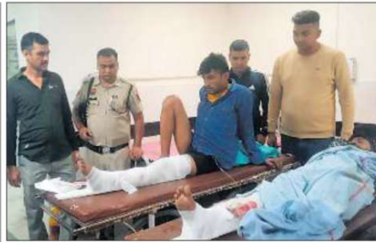
The two miscreants, who sustained bullet injuries during encounter, admitted to PGIMS, Rohtak.

"Similarly, the STF has identified 20 of the most-dangerous criminals across the state, and stringent action is being taken against them," said the police spokesperson. To strengthen police-public collaboration and make Operation Trackdown more effective, IG Crime has made his personal mobile number 90342 90495 public, allowing citizens to confidentially share information about criminals.