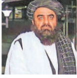
Taliban minister Amir Khan Muttaqi being received on his arrival in New Delhi.